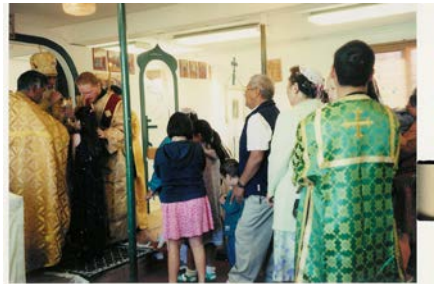
Worshiping in the rented Moravian Building since February 2000.