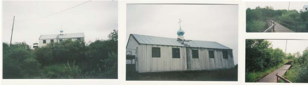
St. Sophia Orthodox Church – Summer 1999