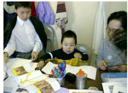
First Sunday School Program developed on the second floor of the Moravian building in 2006. “Sister Parish” project of Outreach Alaska – Building on a sure foundation!