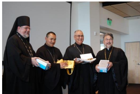
His Grace and Chancellor present gifts to newly ordained clergy.