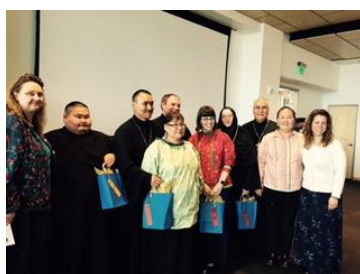
Sisterhood presents gifts to the graduates.